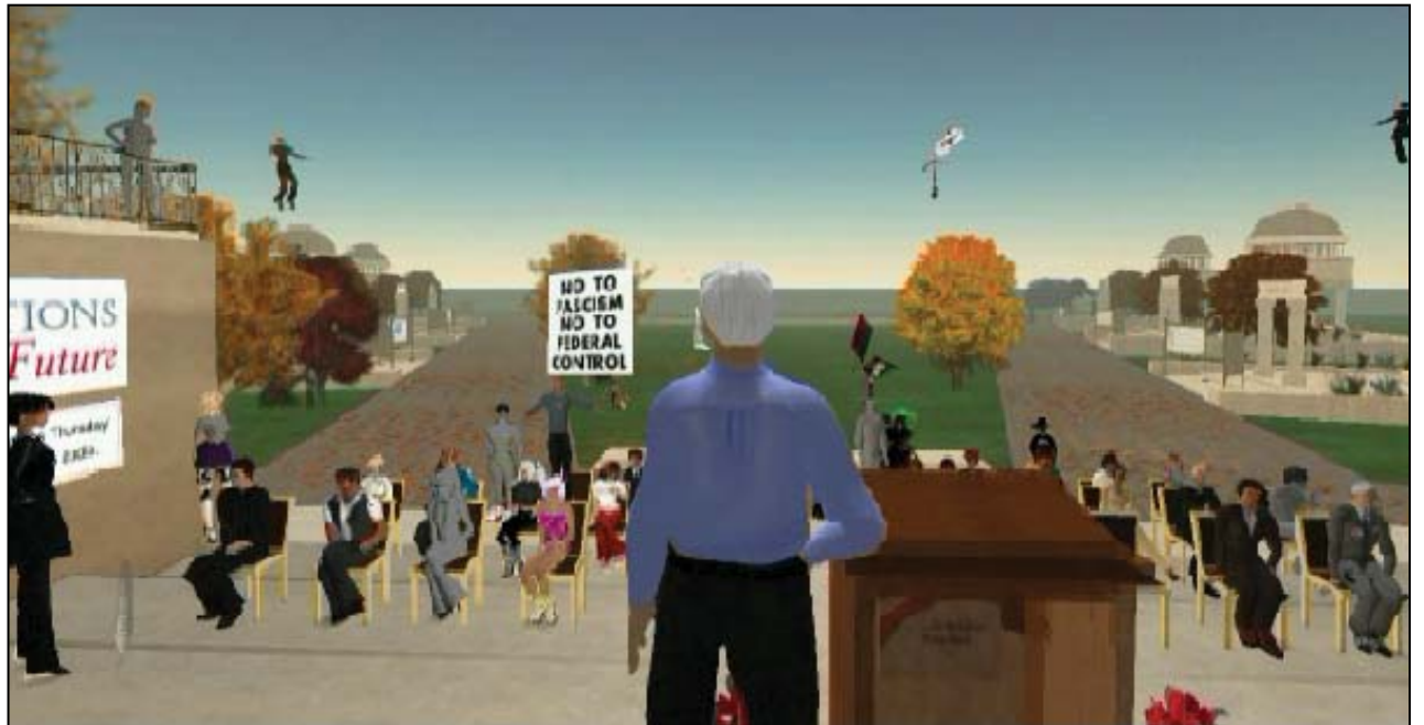
Former Speaker of the United States House of Representatives, Newt Gingrich, speaks at the West Front of the U.S. Capitol in Second Life.

Second Life Capitol Hill is a nonpartisan region created by Clear Ink for the benefit of the Second Life community as a venue for political discussion and education.